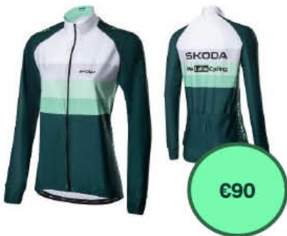
Women's Cycling Long Sleeve