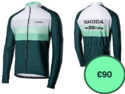
Men's Cycling Long Sleeve