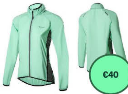
Women's Windproof Jacket