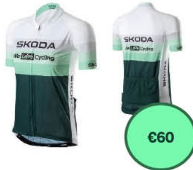
Women's Cycling Long Sleeve