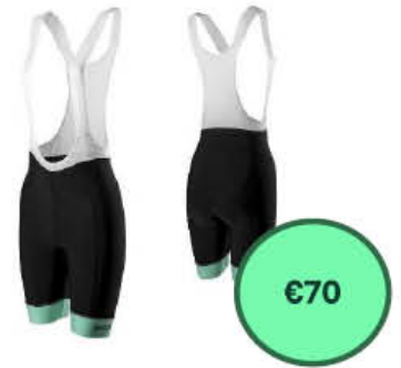
Women's Cycling Bib shorts