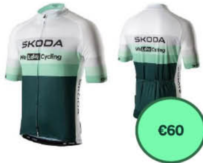
Men's Cycling Jersey