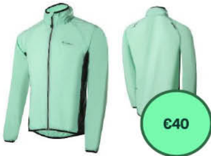
Men's Windproof Jacket