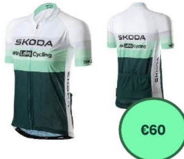
Women's Cycling Long Sleeve