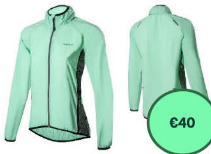
Women's Windproof Jacket