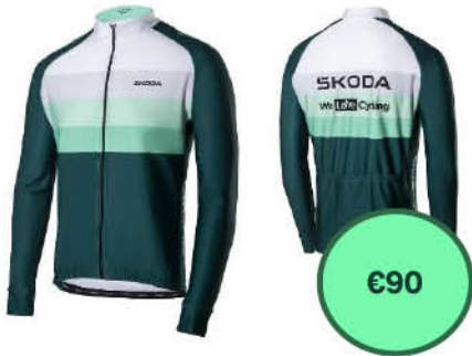
Men's Cycling Long Sleeve