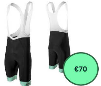
Men's Cycling Bib shorts