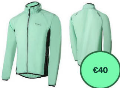
Men's Windproof Jacket