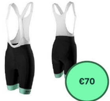
Women's Cycling Bib shorts