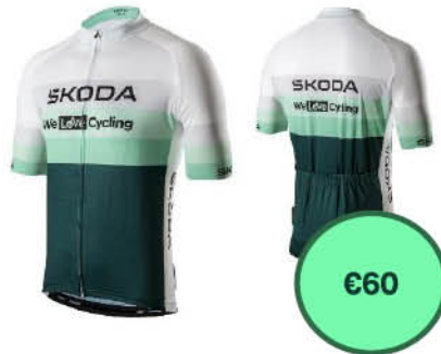
Men's Cycling Jersey