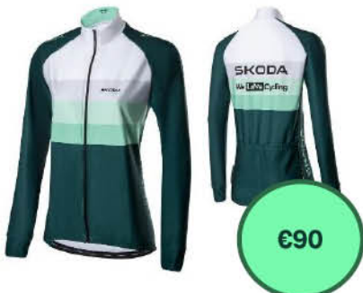
Women's Cycling Long Sleeve