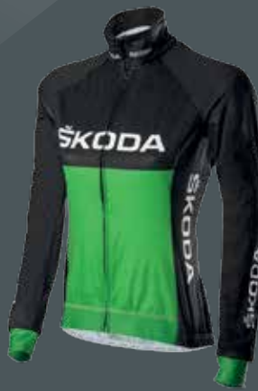
Women's Jacket €65