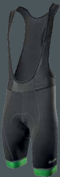
Men's Bibshorts €45