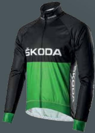
Men's Jacket €65