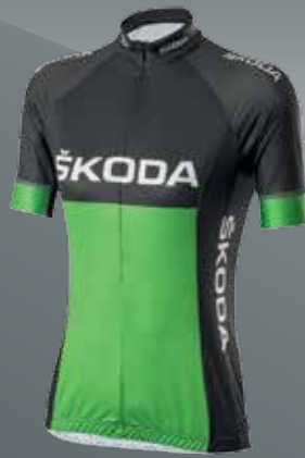
Women's Jersey €35