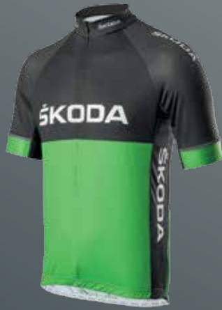
Men's Jersey €35