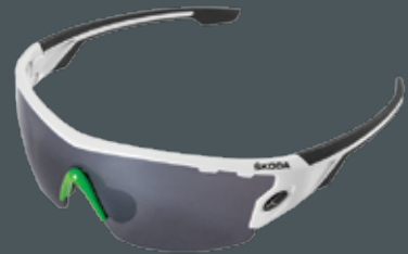
Cycling Sunglasses €15