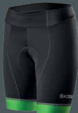
Women's Shorts €40